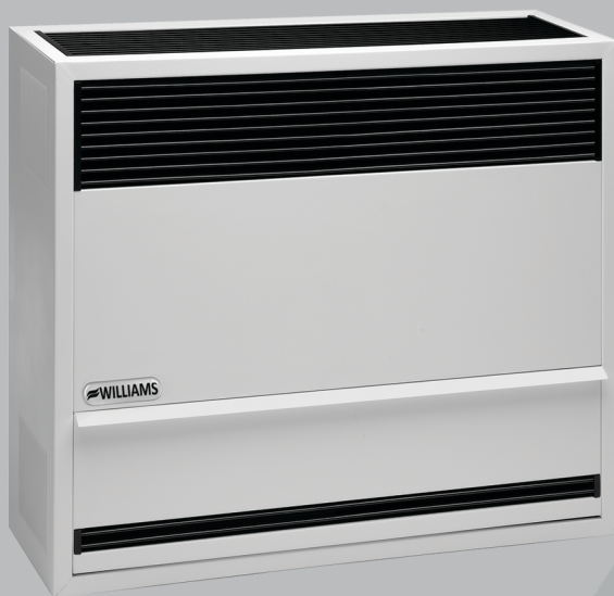
22,000 and 30,000 Btu/hr.

Attractive styling, economical and safe heating comfort with these popular home furnaces. Williams' compact, space-saving direct-vent furnaces feature low-cost installation. Heating rooms individually allows for comfort in areas being used while saving fuel costs in unused areas. These models use no inside air for combustion.