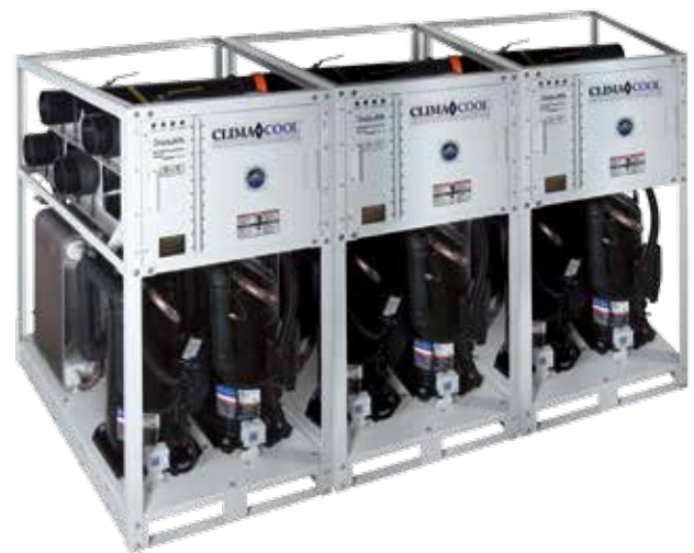
Photo shows three 70 ton modules totaling 210 tons capacity. The 15, 25, 30, 50 and 70 ton modules are configurable up to 400 tons per bank. The 85 ton module is configurable up to 1,000 tons per bank.

True Redundancy Separate module electrical feeds provide true electrical redundancy. Dual independent refrigeration circuits per module provide true mechanical redundancy.