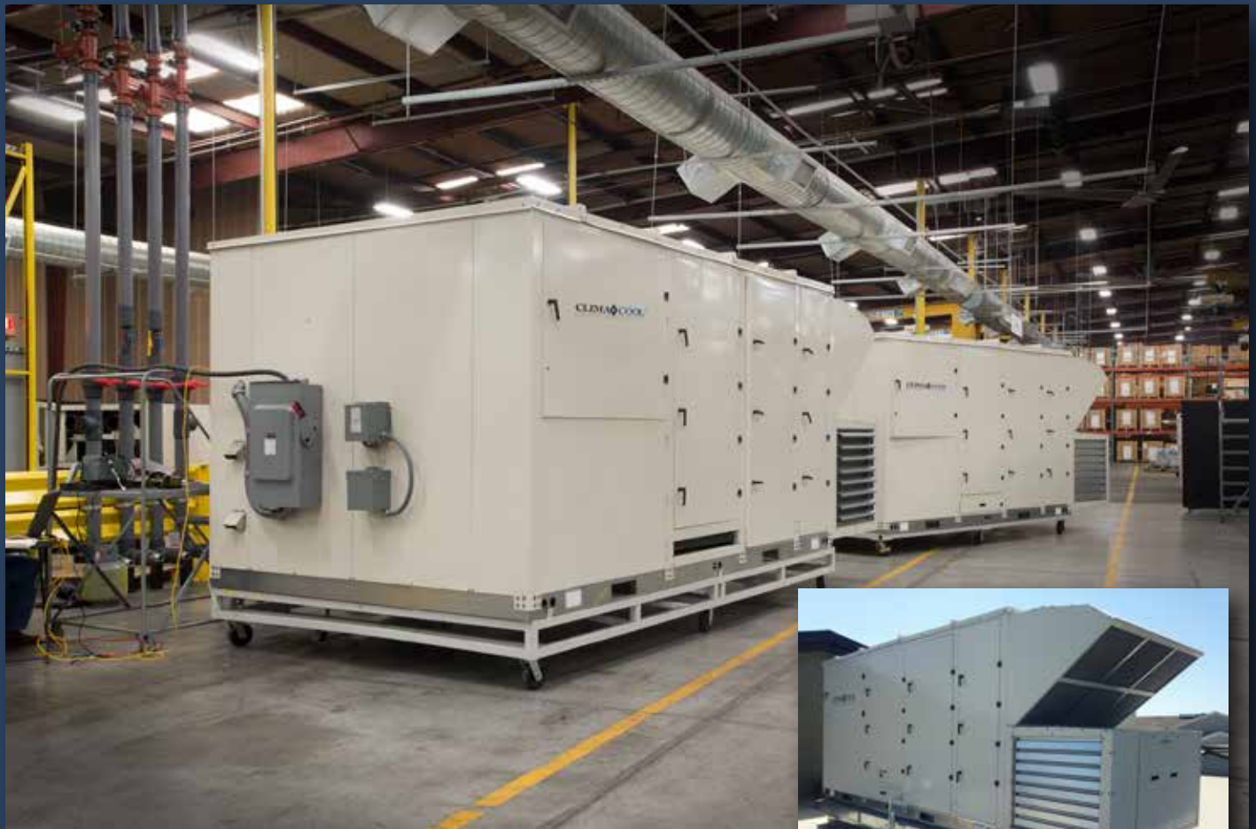
Pine Have Christian Communities | Sheboygan, WI