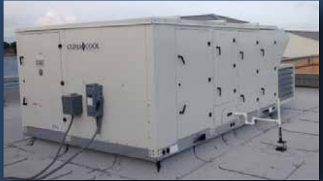
Briarwood Elementary | Moore, OK