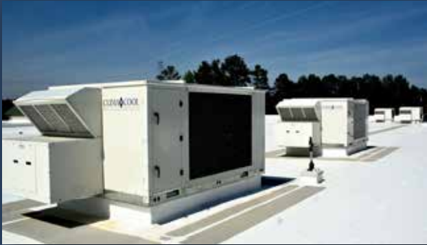
Norcross Cluster Elementary | Norcross, GA