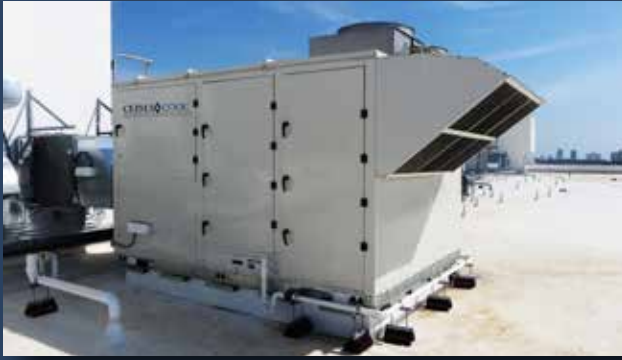
Treasure on the Bay | North Bay Village, FL