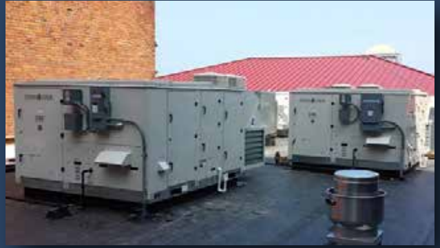
Hofbrauhaus | Cleveland, OH