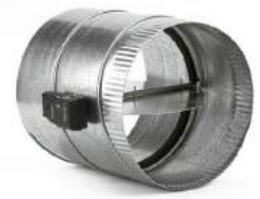
Model: RDP Round Zone Damper