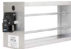
Model: ZDSP Zone Damper