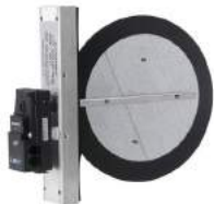
Model: RRP Retro-Round™ Insert Damper