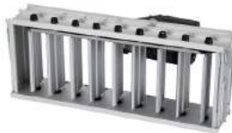
Model: OZD Outlet Zone Damper