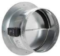
Model: RTP Round Take-Off Damper

25' of cord included with every damper | Easy, Plug & Play Application | Up to 10 dampers per zone