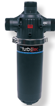
TD Series Turbo Disc Filter