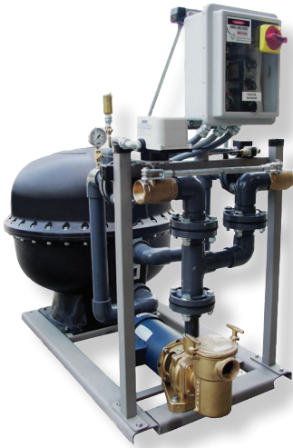
PS Series Sand Media Filter