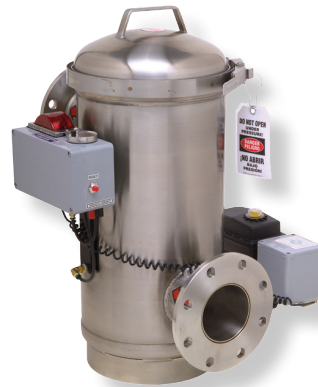
SF Series Strainer Filter